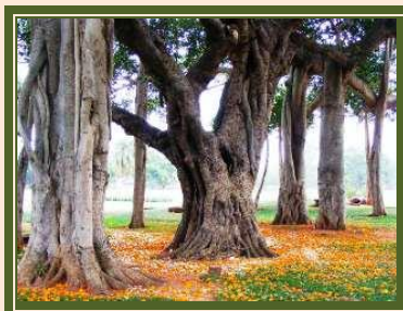
Banyan Tree at Auroville

Last date for applications for August 2010 session: June 1, 2010